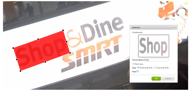
Fig. 3. Annotators are shown a real time preview of a rectified version of the word region being defined.

A screenshot of one of the Web-based annotation tools can be seen in Figure 5. The hierarchy of textual content and the