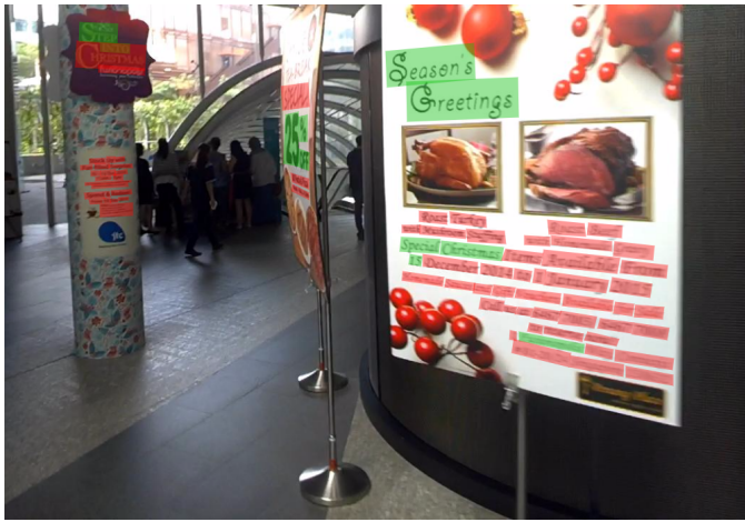
Fig. 4. Do not care regions appear in red, normal regions appear in green. Do not care regions do not have to respect the granularity of the rest of the ground truth. In the example, words have gone through a second-stage verifications where their readability was judged individually to eliminate any annotation bias introduced by contextual information (e.g. words that can be guessed to say “roast chicken” due to the visual context were judged as unreadable when seen individually).

is clear (e.g. if the words on the left and right are readable the middle word can be easily guessed), and annotators have trouble deciding whether such text should be actually marked as do not care or not. To reduce such subjective judgements different verification processes are available through the RRC platform, including interfaces for verifying words on their own, out the context, which has been shown to eliminate the inherent bias of annotators to use textual context to guess the transcription (see Figure 4).