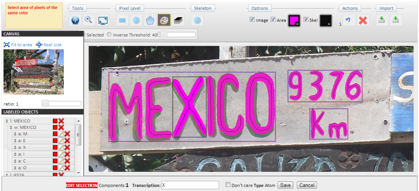
Fig. 5. A screenshot of one of the Web-based annotation tools.